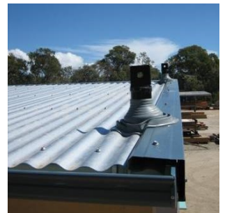
PICTURED ABOVE: Lifting points for site transportation